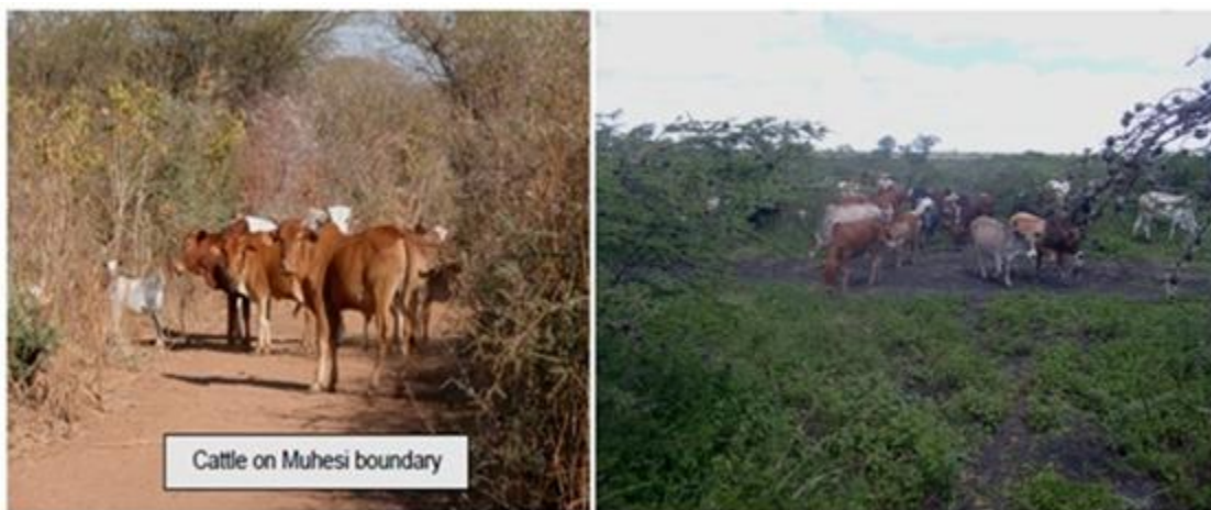
Figure1; Pastoralist with cattle in Muhesi Game Reserve

Presence of good pasture in GR is among of the factor, which leads to the conflict between pastoralist and wildlife. Protected land is under constant supervision to maintain pastures to wildlife animals and minimizing negative impact which will affect them, therefore remain stable. Meanwhile village land is under overgrazing with minimal or no supervision, which concur with theory of tragedy of the common. Study revealed that, presence of good pasture within the wildlife area was among of the main sources of conflict between wildlife and pastoralist. Wildlife areas are characterized by good kind of pasture, which attracts pastoralist to graze their animal within. Furthermore, even during rainy season where pasture available in village land still pastoralist direct their cattle in the protected area to avoid substantial fight among themselves in village land which is already surpass its carrying capacity.