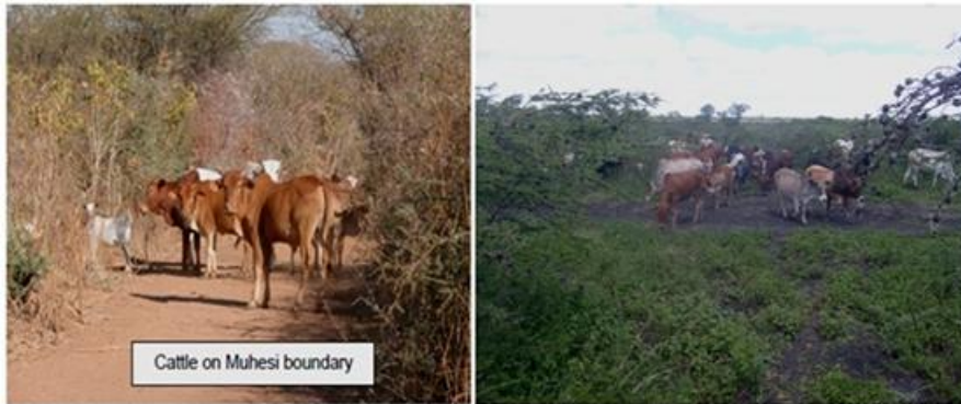
Fig.2. Pastoralist with cattle in Muhesi Game Reserve

pastoralist direct their cattle in the protected area to avoid substantial fight among themselves in village land which is already surpass its carrying capacity (Fig.2).