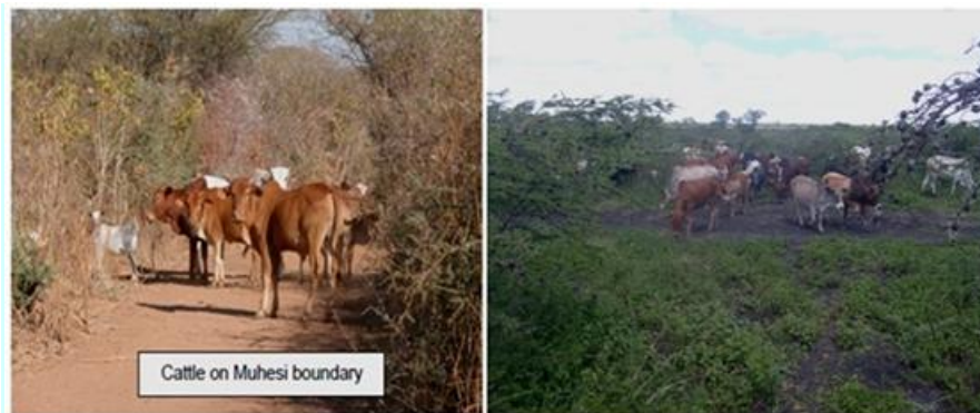
Figure1; Pastoralist with cattle in Muhesi Game Reserve

Presence of good pasture in GR is among of the factor, which leads to the conflict between pastoralist and wildlife. Protected land is under constant supervision to maintain pastures to wildlife animals and minimizing negative impact which will affect them, therefore remain stable. Meanwhile village land is under overgrazing with minimal or no supervision, which concur with theory of tragedy of the common. Study revealed that, presence of good pasture within the wildlife area was among of the main sources of conflict between wildlife and pastoralist. Wildlife areas are characterized by good kind of pasture, which attracts pastoralist to graze their animal within. Furthermore, even during rainy season where pasture available in village land still pastoralist direct their cattle in the protected area to avoid substantial fight among themselves in village land which is already surpass its carrying capacity.