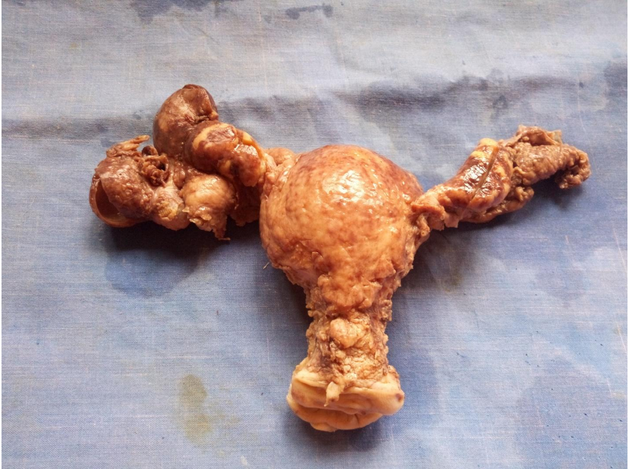
Figure 1: TAH specimen showing tubo-ovarian abscesses the left > the right.