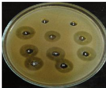
Fig.2: Well diffusion test (antimicrobial agent and antibiotics show clear inhibition zones around wells).