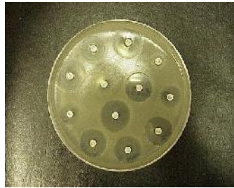
Fig.1: Disc diffusion test (antimicrobial zones of inhibition around treated discs).

bacteria including Streptococci through use of specialized media and incubation conditions. The amount of antimicrobial agents or antibiotics applied to discs in ug/ml is inversely proportional proportioned to the zone of inhibition diameter width, for some antimicrobial agents, the disc diffusion zone diameters do not correlate with minimum inhibitory concentration (MIC) values [12-16]. In the well diffusion test, bacterial inoculum culture to be tested was spread on nutrient agar plates with the aid of sterile swab and 10mm diameter were punched into the agar medium under aseptic condition and filled with about 100µl of the required concentration of extracts or antimicrobial agent and allowed to diffuse at room temperature for about one hour. The plates were then incubated at 37°C for 24 hours. Positive and negative controls should be applied at the same conditions. Zone diameter of inhibition was then measured in mm (Figure 2).